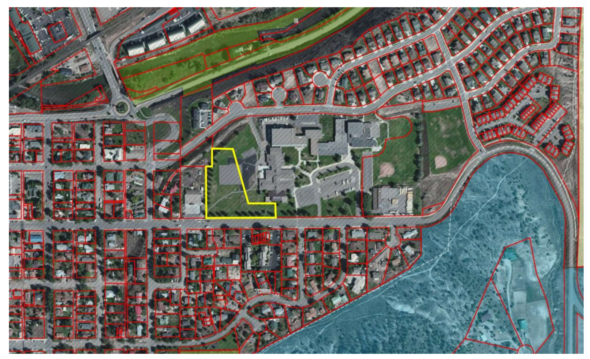
An aerial view map shows the location of the portion of public land that Eagle County Schools is looking to use to construct 16 new units of workforce housing in Eagle. If approved, the subdivision would be constructed at the west end of the school district's property off Third Street in Eagle next to the Greater Eagle Fire Protection District.

The development is planned for the west end of the school district's campus on Third Street and the units will be constructed in the form of eight duplexes, according to the sketch plan.